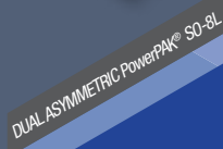
DUAL ASYMMETRIC PowerPAK® SO-8L

Optimized High and Low Side Combination for Synchronous Buck