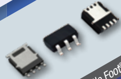
PowerPAK® Little Foot®

75 % Thinner and 55 % Smaller Than D 2 PAK