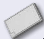
Known Good Die (KGD)

Bare Die Supplied in Tape and Reel and Fully Tested